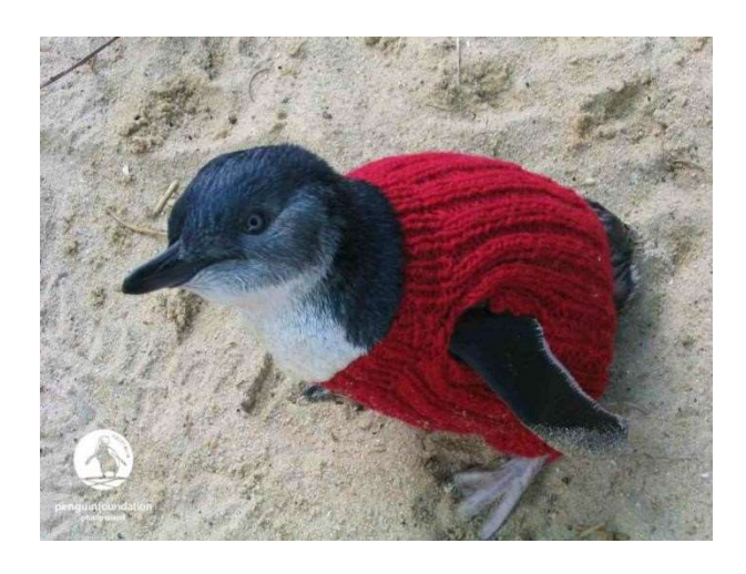
Little penguin in knitted jumper recovering from oil pollution at the Phillip Island Wildlife Clinic