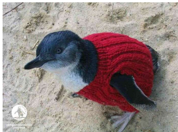
Little penguin in knitted jumper recovering from oil pollution at the Phillip Island Wildlife Clinic