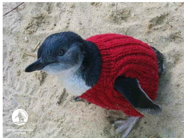
Little penguin in knitted jumper recovering from oil pollution at the Phillip Island Wildlife Clinic