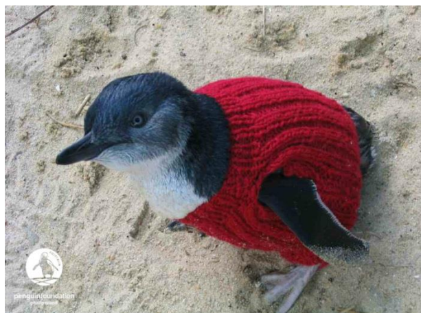
Little penguin in knitted jumper recovering from oil pollution at the Phillip Island Wildlife Clinic